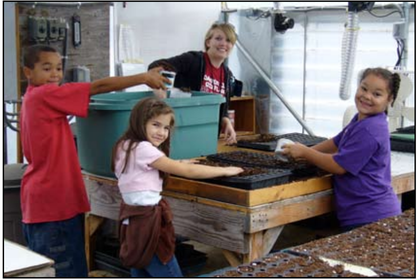
Moffitt Elementary students offer a helping hand at the Nursery through one of many service learning opportunities with FBP.

As always, volunteers played a major role in the success of nursery operations, investing over 1900 hours during 2007 into tasks from seeding to weeding, mulching and trimming, transplanting, inventorying, and harvesting and processing. Not only does all that physical activity in a beautiful setting keep adults looking and feeling young, it also provides the youth of our community with service-learning opportunities.