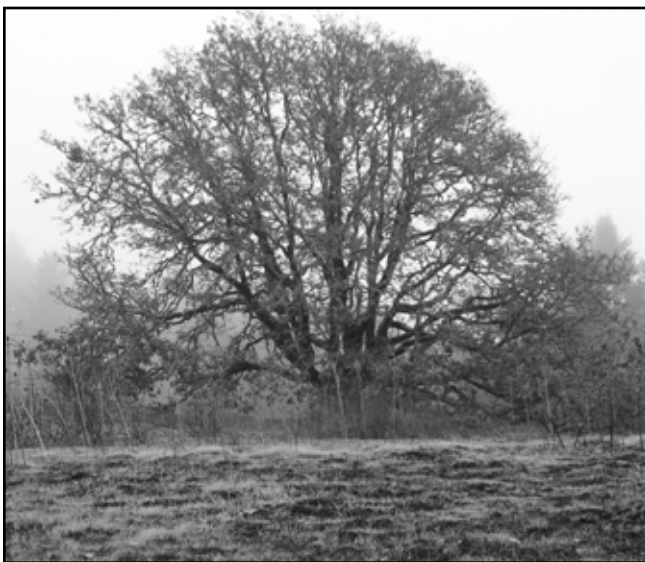
A legacy white oak on Mt. Pisgah, typical in oak savanna habitat at Mt. Pisgah.