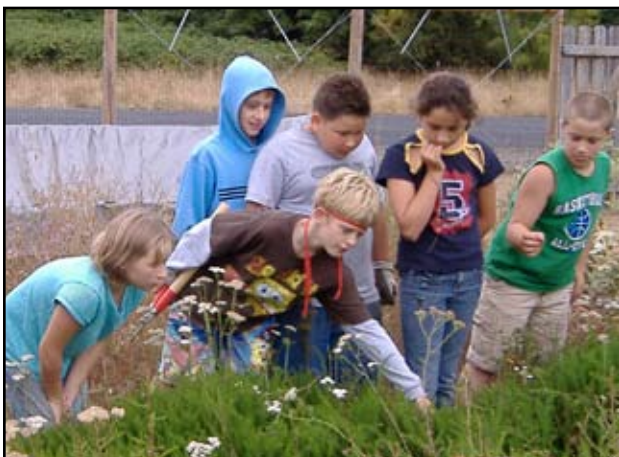
A giant spider at the Native Plant Nursery captivates this group of kids from Willamalane's Kids Club program.