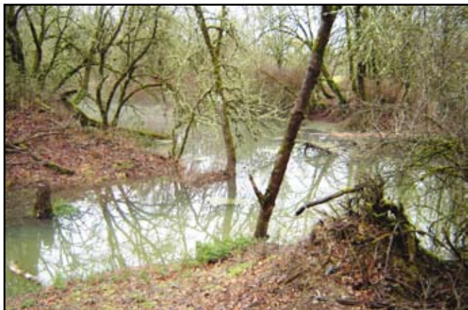
An interpretive overlook along the restored backwater would educate visitors about the wildlife, fish and water quality benefits of healthy floodplains.

The South Meadow Management Plan, adopted in 2002 by Lane County, established goals to enhance this area's floodplain habitats and improve visitor's recreational and educational