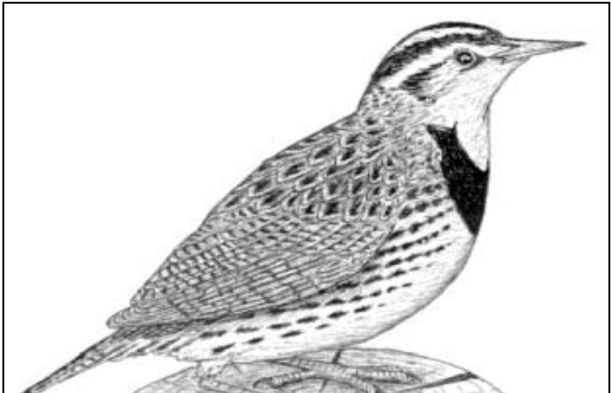
Oregon's state bird, the Western Meadowlark, is identifiable by its yellow belly and black "V"-shaped necklace.

Nest building begins in March and only the female meadowlark builds the nest. Eggs are laid in late April and early May with only the female incubating the eggs. Usually five eggs are laid, but there could be three to seven. After 13 to 15 days the eggs hatch. The nestlings are ready to fly around 11 to 12 days later. Most female meadowlarks will have two broods each a year if the conditions are good.